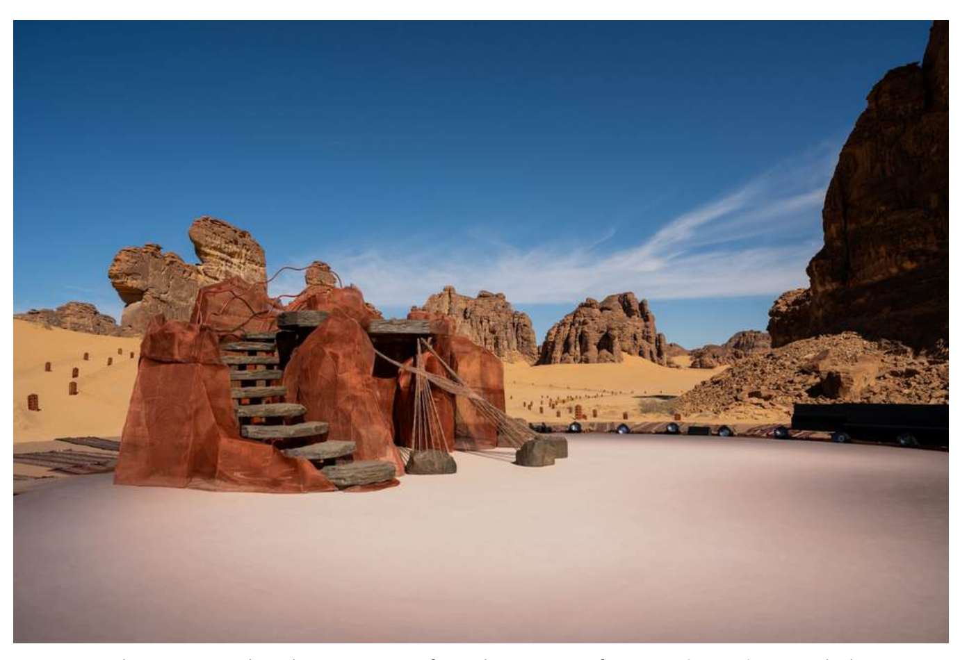
The scenography takes inspiration from the site-specific stage design by Manal AlDowayan